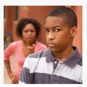
Has this happened?

I don't seem able to connect to my son or daughter.