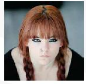
Is this your child?

I tell lies to cover up for my child's behaviour.